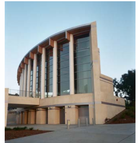
International House Great Hall